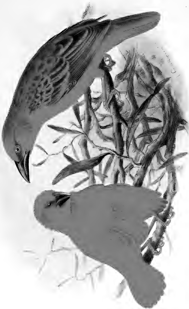
1. Xanthophilus holoxanthus . 2. X. princeps .